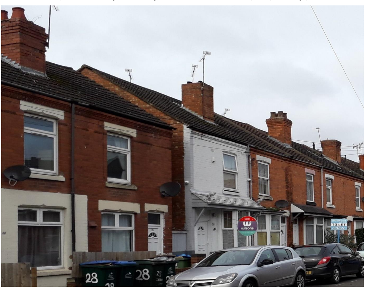
5.5 The policy approach to managing HMOs in Coventry is set out below with a suite of policies coupled with a reasoned justification. Strategic Environmental Assessment / Sustainability

5.4 At the current time, any proposal for a small HMO is classed as permitted development. However, this DPD has been developed in parallel with an Article 4 Direction which has withdrawn those permitted development rights for small HMOs. There are significant existing concentrations of HMOs in certain wards across the city, which are covered by the Article 4 Direction, meaning that like large HMO proposals, small HMO proposals (less than 7 unrelated occupants in a single dwelling) in those areas now require planning permission.